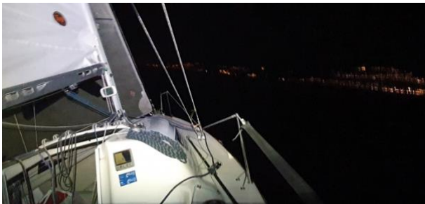
MammaMia at night, 16 knots of wind from broad reach, with heading Yvoire (F) on the Grand Lac at 5am in the morning.