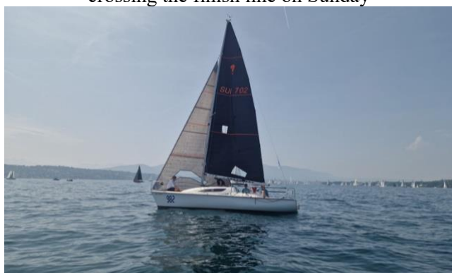
Mamma Mia right after the race start