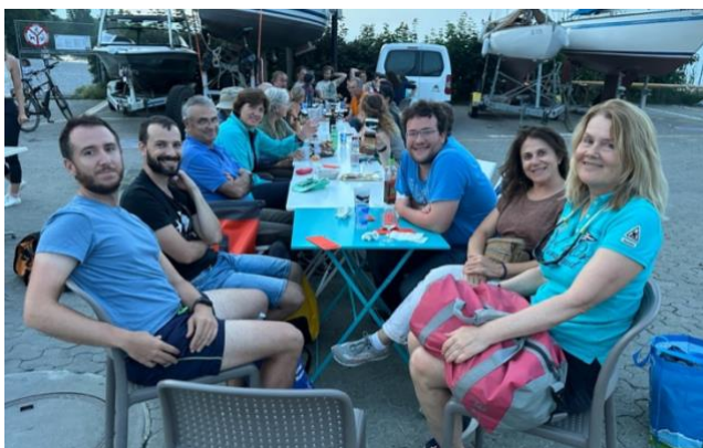
CNV table is not long enough to accommodate all of us.