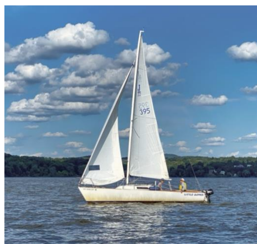
Little Dipper on the Hudson River, NY. 2021.

About 6 years later I left CERN, YCC and Y-KNOT behind. But I continued sailing on a variety of boats. A few years ago, I reverted back to keelboat sailing on a J/22, which is in fact very similar to an Yngling and hence reminded me of my Y-KNOT years.