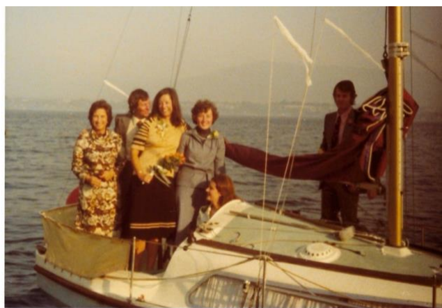
Leaving the Mairie de Versoix.