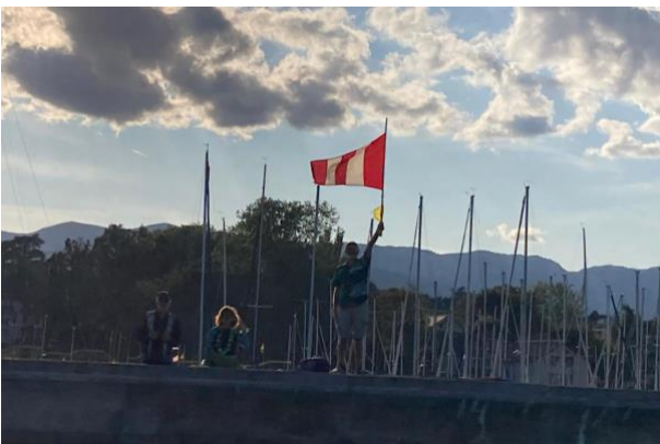
Regatta 26 July