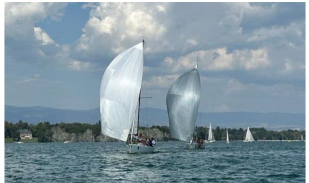
Regatta 20 August