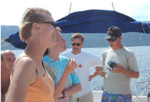
Good humour on board "God Friend"

Wednesday morning we decided to have a look at the famous waterwheel at the cape north of Argostoli, which is driven by seawater disappearing in a crack in the island. Apparently this water resurfaces in the west of Kefhalonia in an underground grotto. Up to this date it is not clear what forces the water along this path. Swimming a few meters away from the bathing platform suddenly two dolphins surface between two of us and our boat. They disappear and resurface again and