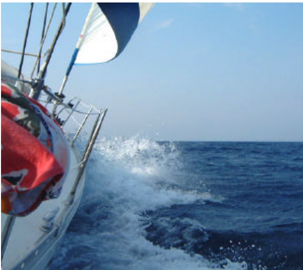
Good speed on the Sun Odyssey 45.2 "God Friend"

On Wednesday morning got out of our berths unusually early, because we wanted to sail all the way to Fiskardo on Kefhalonia, a leg of more than 60 nm. We carefully drifted across the shallow, southern entrance of Gaios harbour and set sail immediately afterwards. The northwesterly winds started unusually early this day, exactly what we needed to get south. By 11 am we had already 20 to 25 knots of wind and made very good progress. In fact the wind was blowing into exactly the same direction we wanted to sail, so that we had to tack before the wind. The size of the waves increased more and more during the day, such that helming became real work, but it was sailing at it's best. At 5 pm we approached the southern tip of Lefkas, when we saw a large ribbon of bright turquoise water just in front of us and a few minutes later we crossed from the dark blue deep water straight into it. With the wind and the waves around us it was exhilarating! An hour later we entered the harbour of Fiskardo and found to our surprise the yachts of Paul, Nicola and Armin. Finding a place in the jam-packed bay, but finally we managed to anchor without ramming anybody.