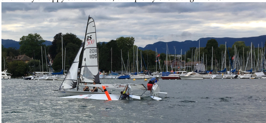
Whoops, must have been a training day...

From the end of the formal courses, sessions were run every Tuesday throughout the season. It was open to all members, regardless of experience. We had plenty of fun seeing who could be first on the list. Similarly, on the water, we held short races improvising with original flags, and many a happy start was had, with plenty of exciting finishes.