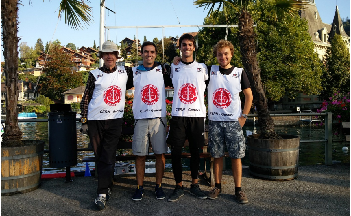
Swiss Sailing YCC team.

We participated in the Challenge league in the Swiss Sailing League event with our team and we bought a new J70 as the class is becoming more and more popular. We also collaborated in the organization of a J70 Swiss Sailing league event in Versoix, another big participation by the Yachting Club CERN as the work force. The helpers won a tour on a D35 by CNV.