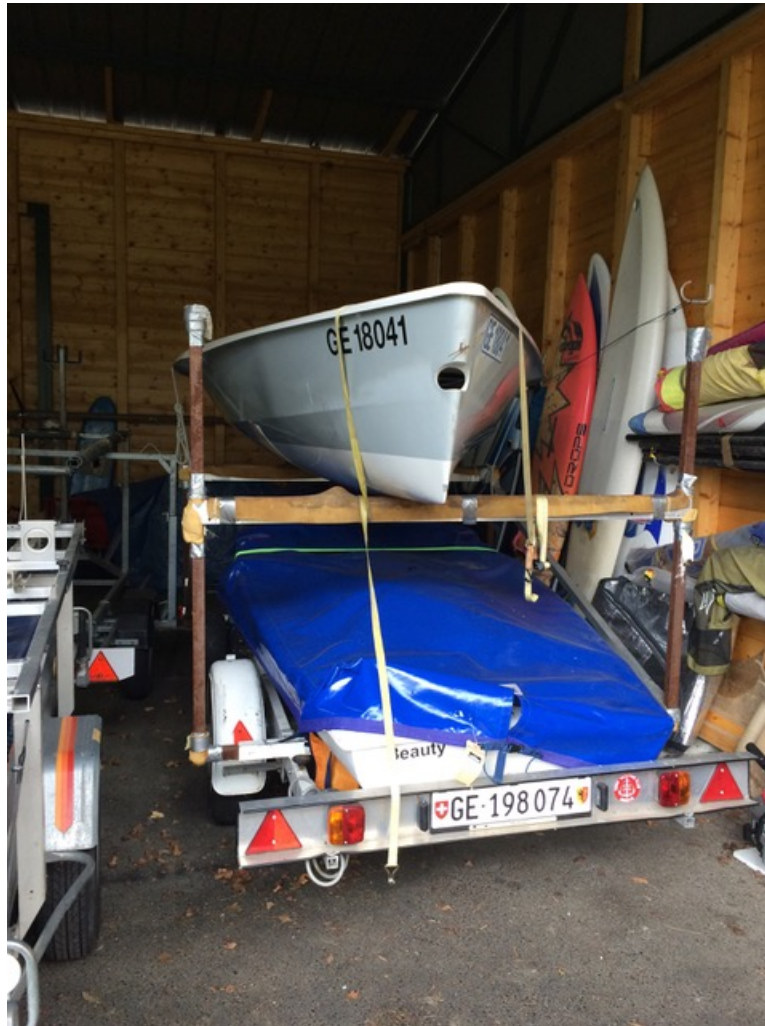
BA5 in winter.

The dinghy maintenance team was dealing with lots of small repairs like broken pulleys and ropes replaced by club members or the maintenance team. We noticed a lot of problems with sailors which got stuck while capsizing. Therefore, we will make sure that every boat has an allocated mast float for the next season. It should be used to protect the crew and the boat. This summer we had also two broken centerboards (Rising Star RS 500 Figure 1 and La Nina RS500) which might be in correlation to a blocked mast of the boat during capsizing.