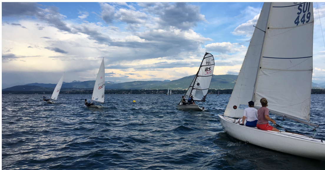
The perfect early evening occupation.