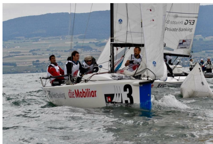
YCC teams in Swiss Sailing Challenge League: Kreuzlingen, Estvayer.