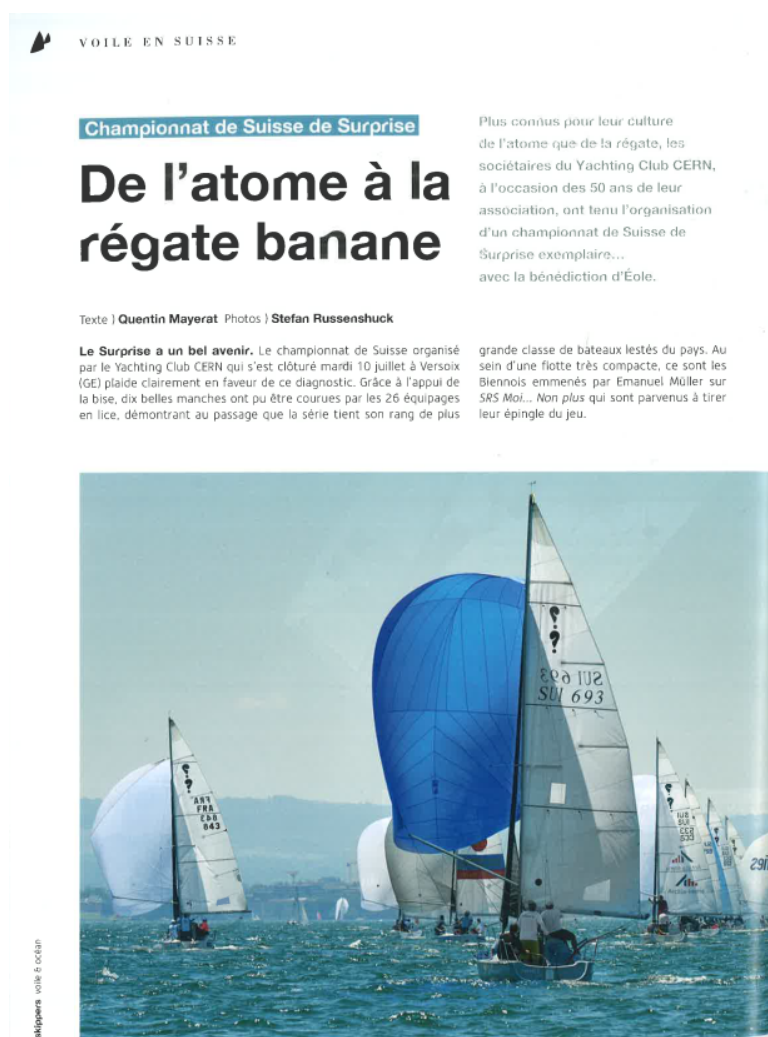
Skipper magazine article on the Surprise Swiss Championship.

The biggest was the Swiss Surprise Championship in collaboration with CNV ( http://cern.ch/yachting/SurpriseSwissChampionship/en/welcome ). The event was a great success with 26 boats and many social events appreciated by the participants, coming from Switzerland, France, Austria and Spain. On that occasion we got a 50 th anniversary speech and present from the Swiss Sailing president. The event made possible also the creation of many extra surveillance shifts for those in a need of a key. The organization required more than a year of work, many helpers and sponsors.