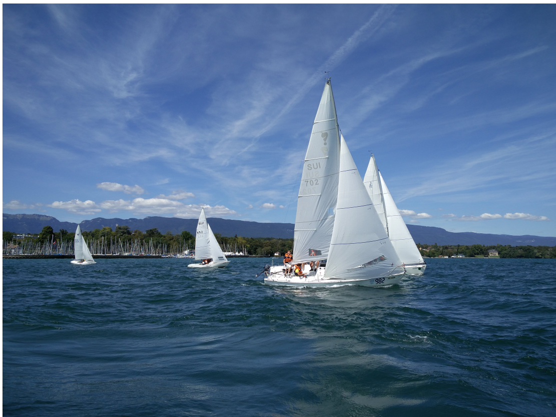
Who is going to win? Two keelboats racing for first place in the Family & Friends regatta this August.