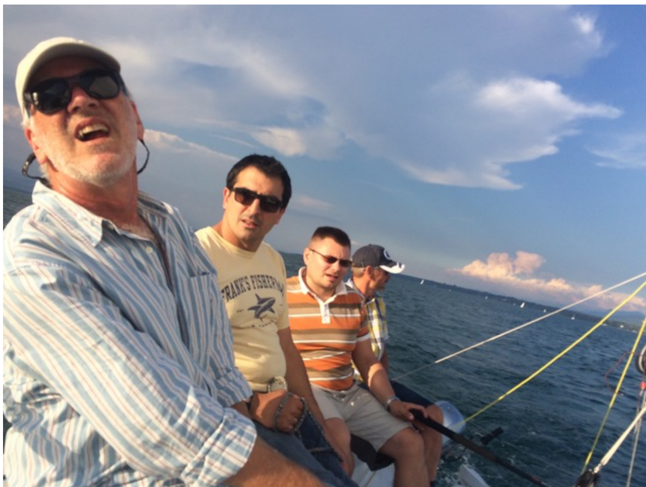
J70 familiarisation.