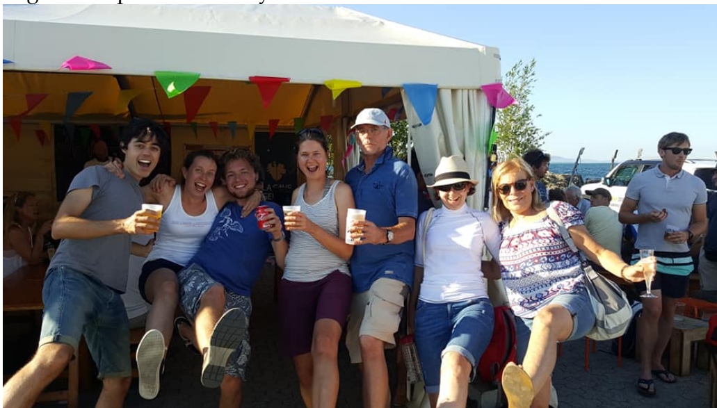
SdS 2018

The “Semaine du Soir” was also managed by YCC as for tent, beers and catering. The relationship with our neighbor club CNV is stronger and stronger, CNV offered to our member the use of the showers and some storage in the port from this year.