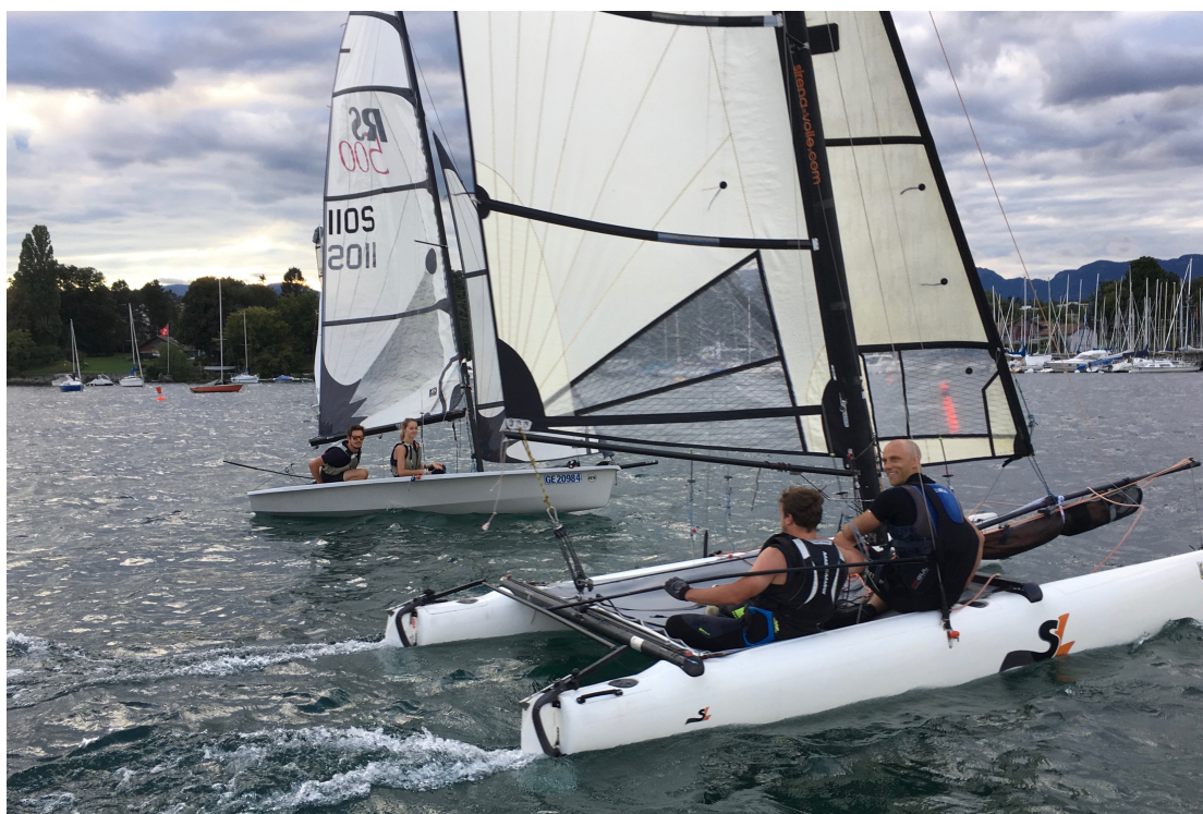
At least they can see the imminent collision...

Next year we will try to improve on this formula by using also the Tornado simultaneously and spreading a bit more the sessions for each student in order to have slightly less intensive weekly schedules. Also, while keeping exposure to more than one instructor, for each student we will establish a more explicit pairing with one specific instructor to facilitate follow-up.