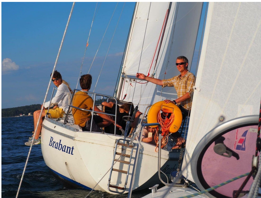
During summer flotilla outing.