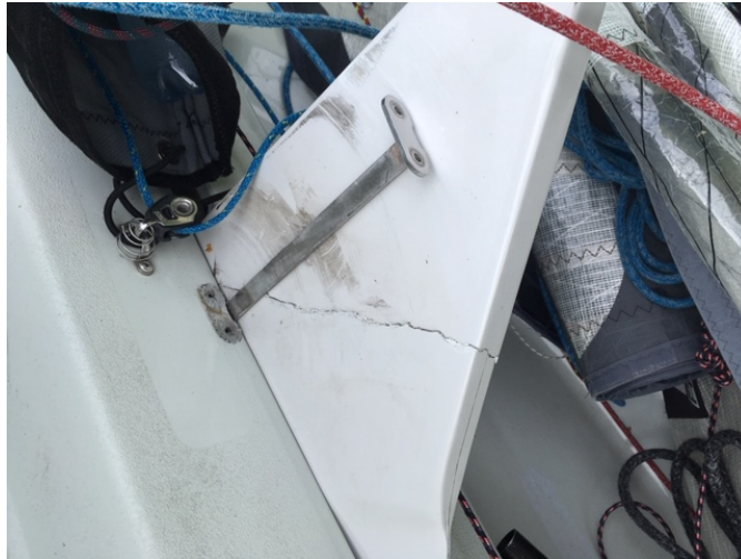
Broken centerboard of Rising Star.

Further, we still had problems with water leaks at the hull of the “Rolling Stone” (from the accident of 2017). It was sent to Marine Création for professional inspection and repair. The boat will be under observation for the beginning of the next season to ensure the body repair was successful.