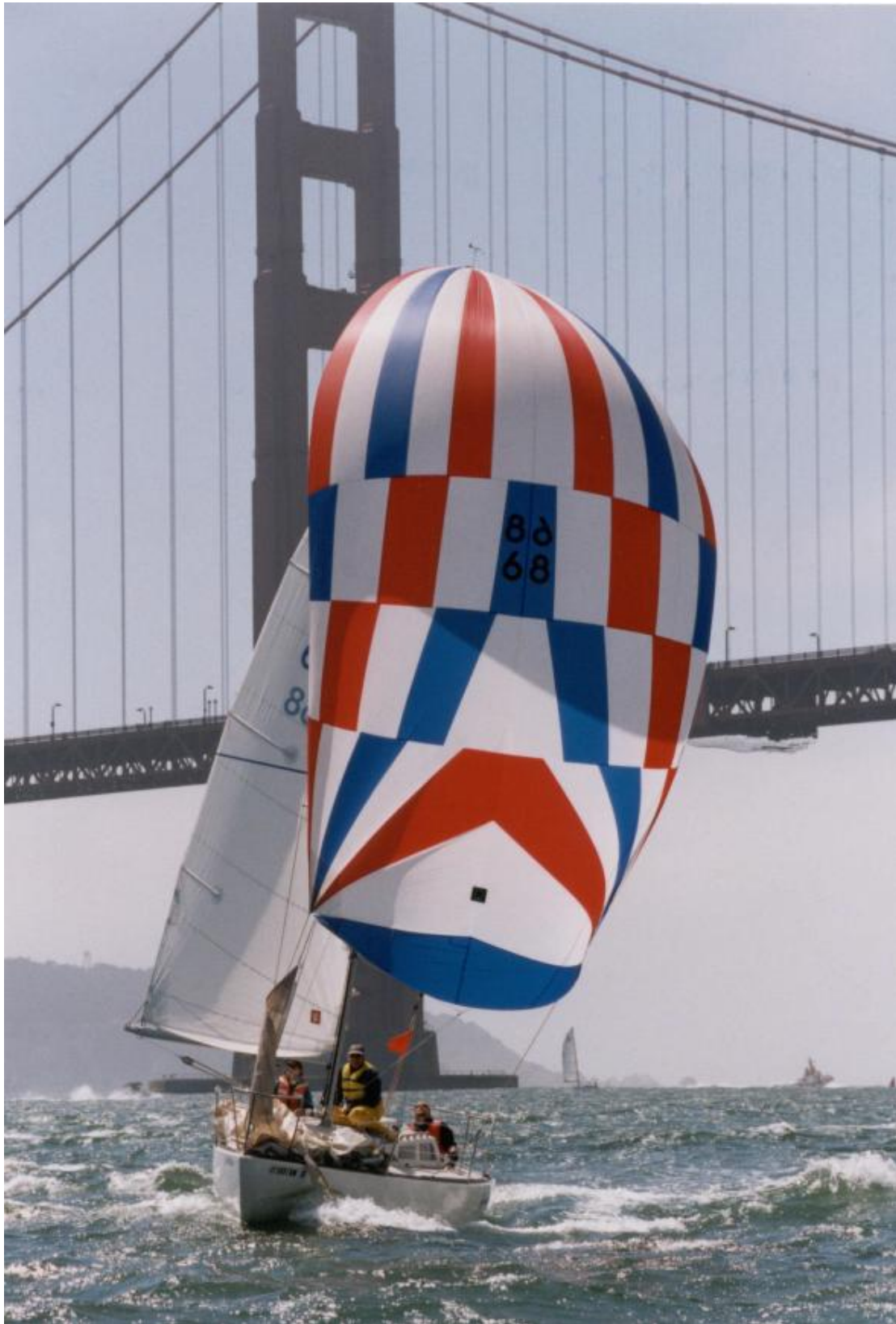
The club was very generously given three spinnakers by a member departing back to the background Bridge (Golden Gate): they will be used for non-gauge training on Surprise and Gipsy