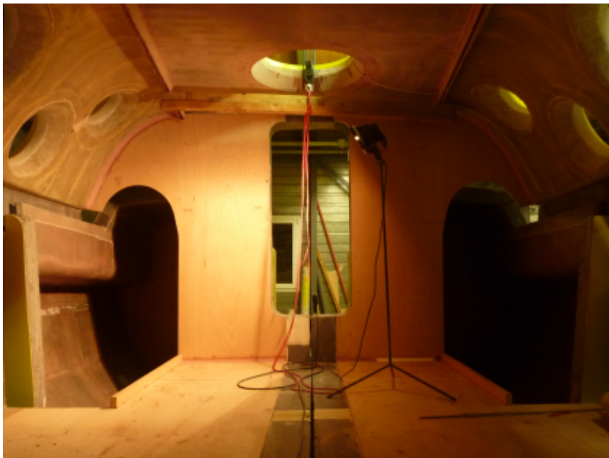
A view of the kitchen, shower, toilet and dining area before installation of benches, tables and the like

The next steps include crew accommodation and equipment of the living quarters as well as navigation equipment. The complete rig and motor should be ordered before the end of the year. The Igloo will be transported to northern France beginning of next year to be assembled into the hull. The sleeping quarters should be insulated and equipped in February. Outfitting and rigging are planned for Easter and first the sea trial in early summer.