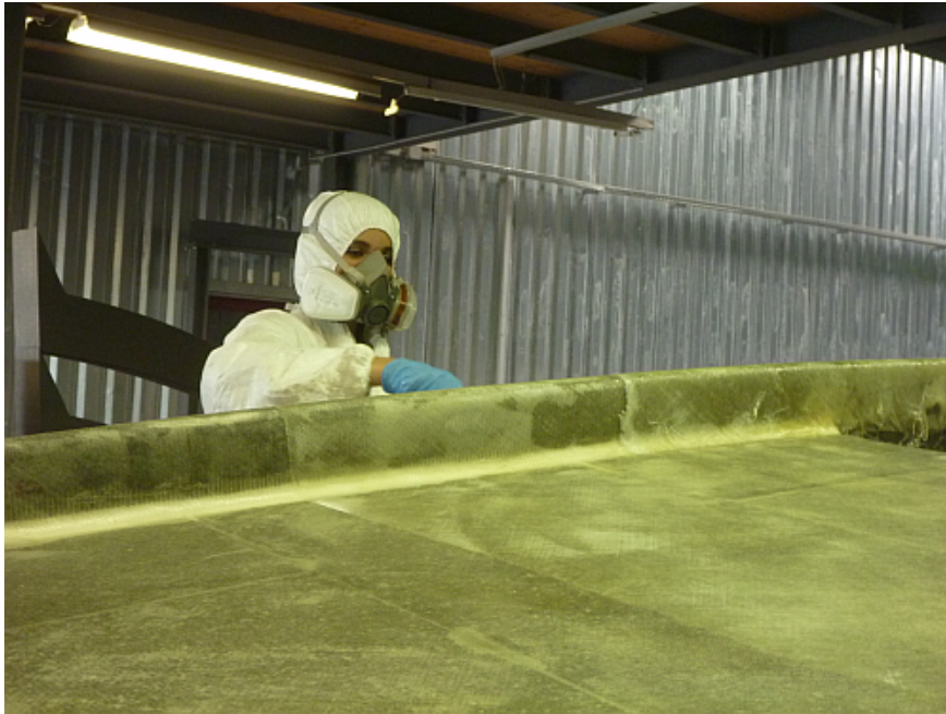
Demanding conditions of safety had to be met at all stages

First cruise is planned for this summer starting from Le Havre, via Scilly Islands to Scotland. From there we plan to set over to Scandinavia and Gulf of Bothnia where Nanuq is supposed to stay over the winter to test winter capabilities.