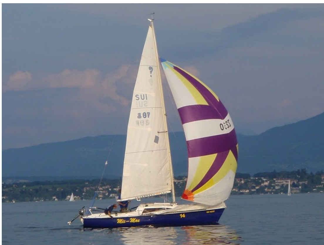
Representative use of the Surprise with a - rare - perfectly set spinnaker