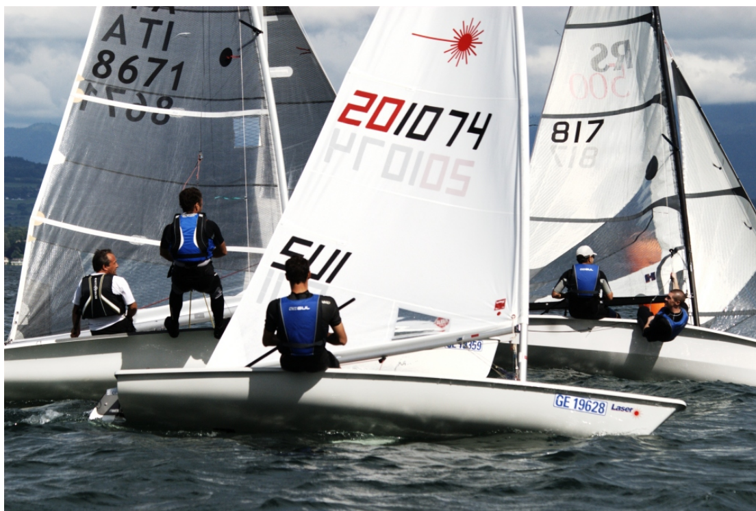
For those of you who have not yet found time to experience our new Laser 1's

available to everybody, no matter what experience they have. The only prerequisite is a true enthusiasm for sailing. Once a team is created, the skipper will guide the crew through the necessary preparations: some work may be needed on the boat - with minimum guidance everybody is happy to contribute. Then you should find time to practice together. I simply cannot overestimate the importance of training.