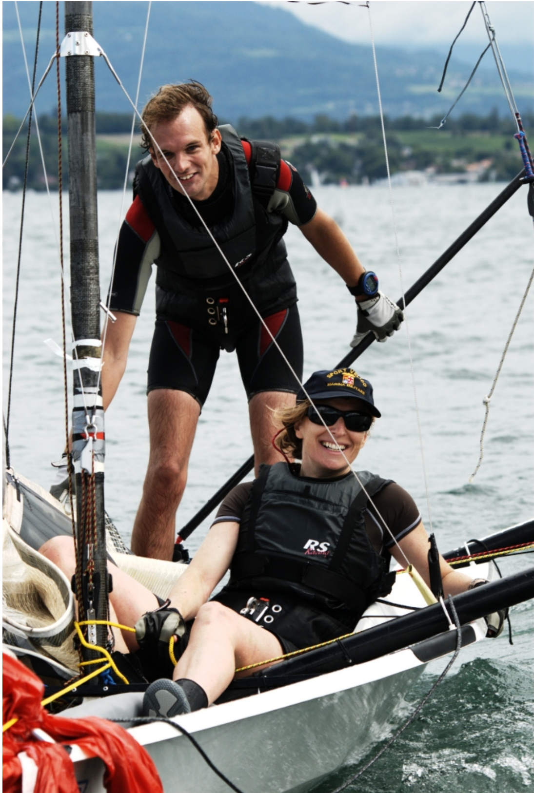
Now are they seriously concentrating on winning this Regatta?