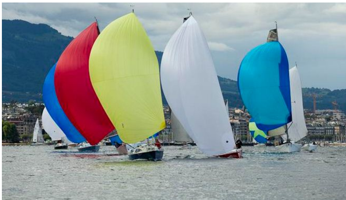
le départ et Mic Mac est à gauche sous spi blanc..