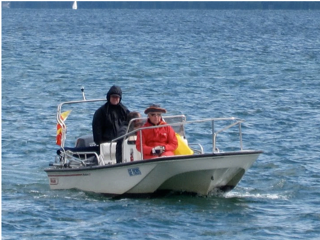
We cannot have an Annual Report without a tribute to ResQ

The YCC courses remain the principal motivating factor for new membership within the club and provide the club with a significant source of revenue. This is only possible through the generosity of experienced club members who volunteer their free time to teach. The table below lists the YCC teachers in 2011, a big thank you from the club's committee to all of them. In addition many thanks go the Q-boat drivers.