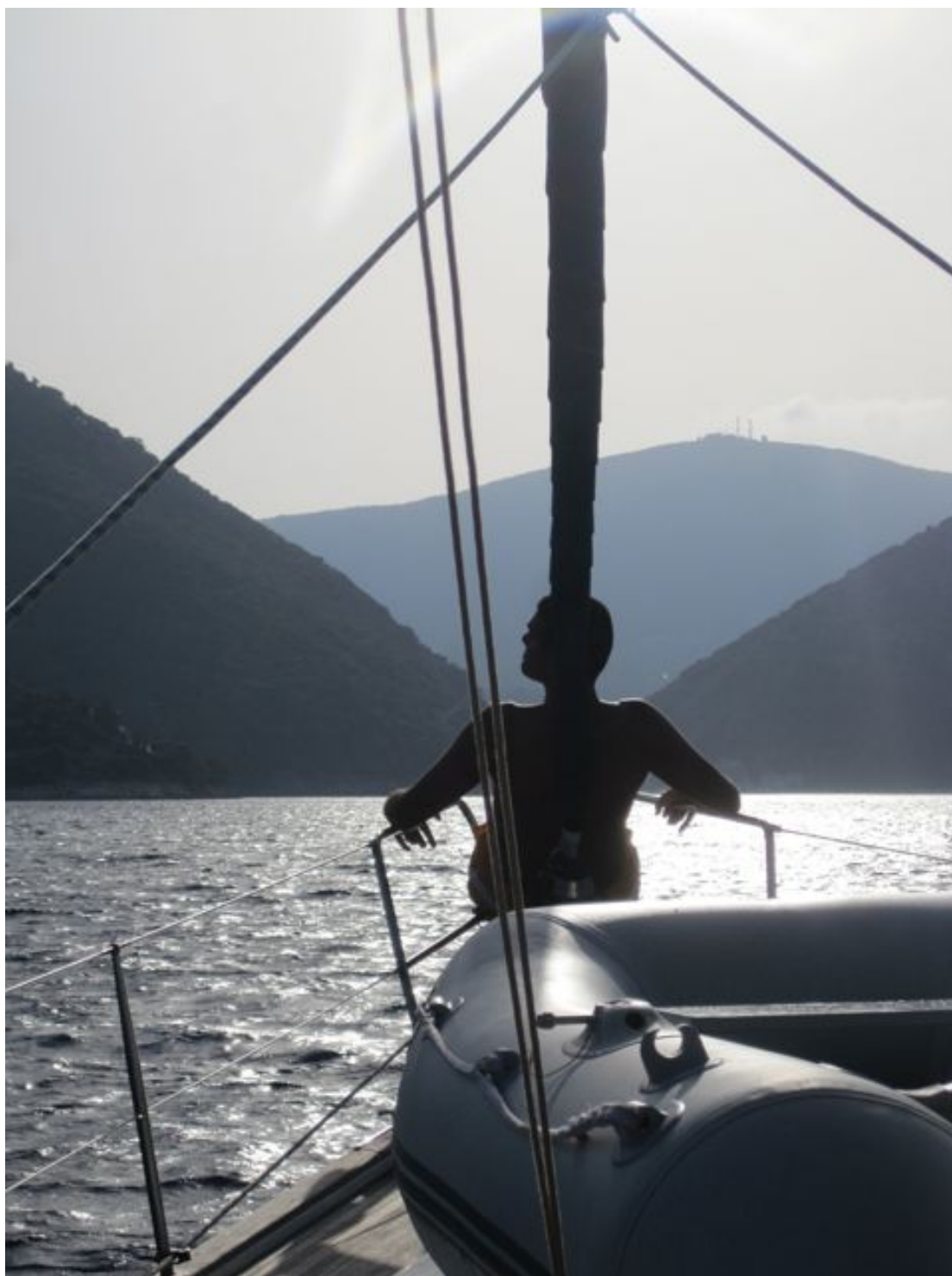
Summer