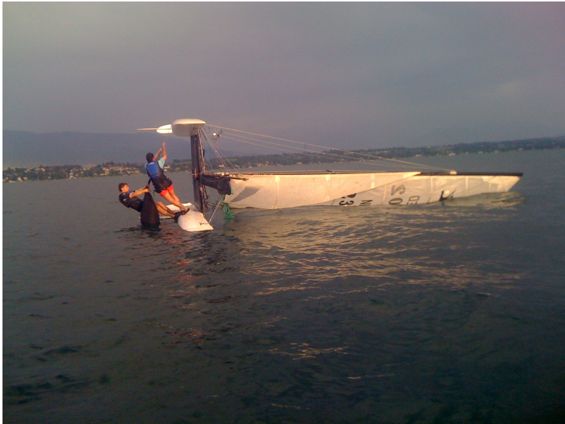
Our Hobie Tiger Meerkat proved deservedly popular and a wise choice of purchase: don't worry, we are sure this capsizing was deliberate practice. The righting bag is the thing they are concentrating on.

Last but not least: the Dinghies are hibernating now in BA5, but many of them require some repairs and maintenance. Here we need your help! Please contact the committee and learn about how you can contribute during the winter season so that all boats are available in a good shape for sailing in 2012!