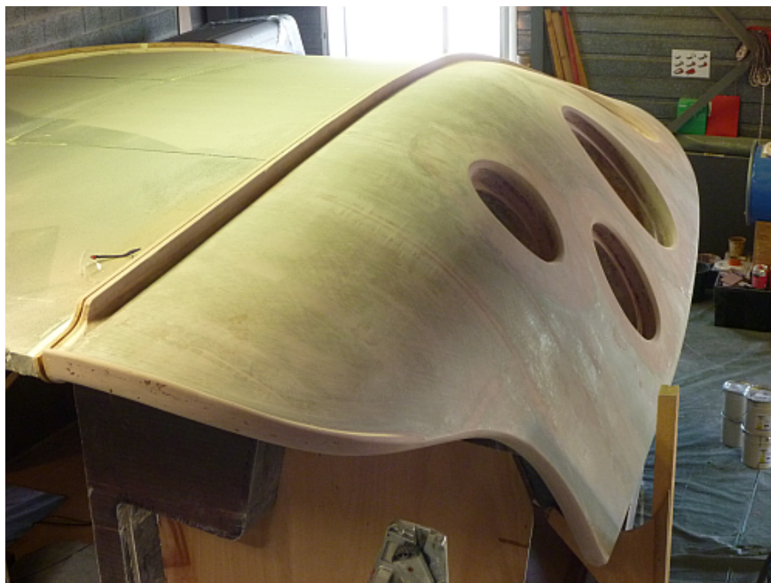
Experts will no doubt recognise this bit ... and where it goes

First cruise is planned for this summer starting from Le Havre, via Scilly Islands to Scotland. From there we plan to set over to Scandinavia and Gulf of Bothnia where Nanuq is supposed to stay over the winter to test winter capabilities.