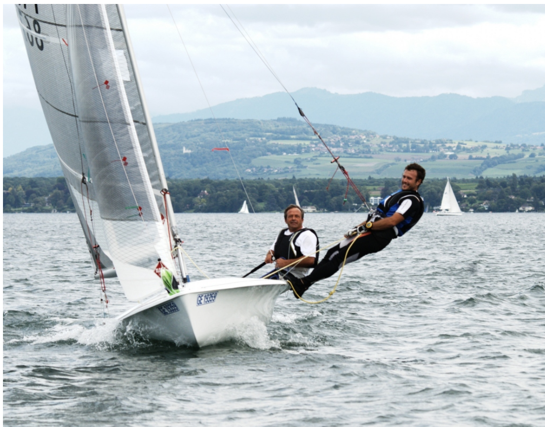
It is our Club boast that more people are using the trapeze this season - and better